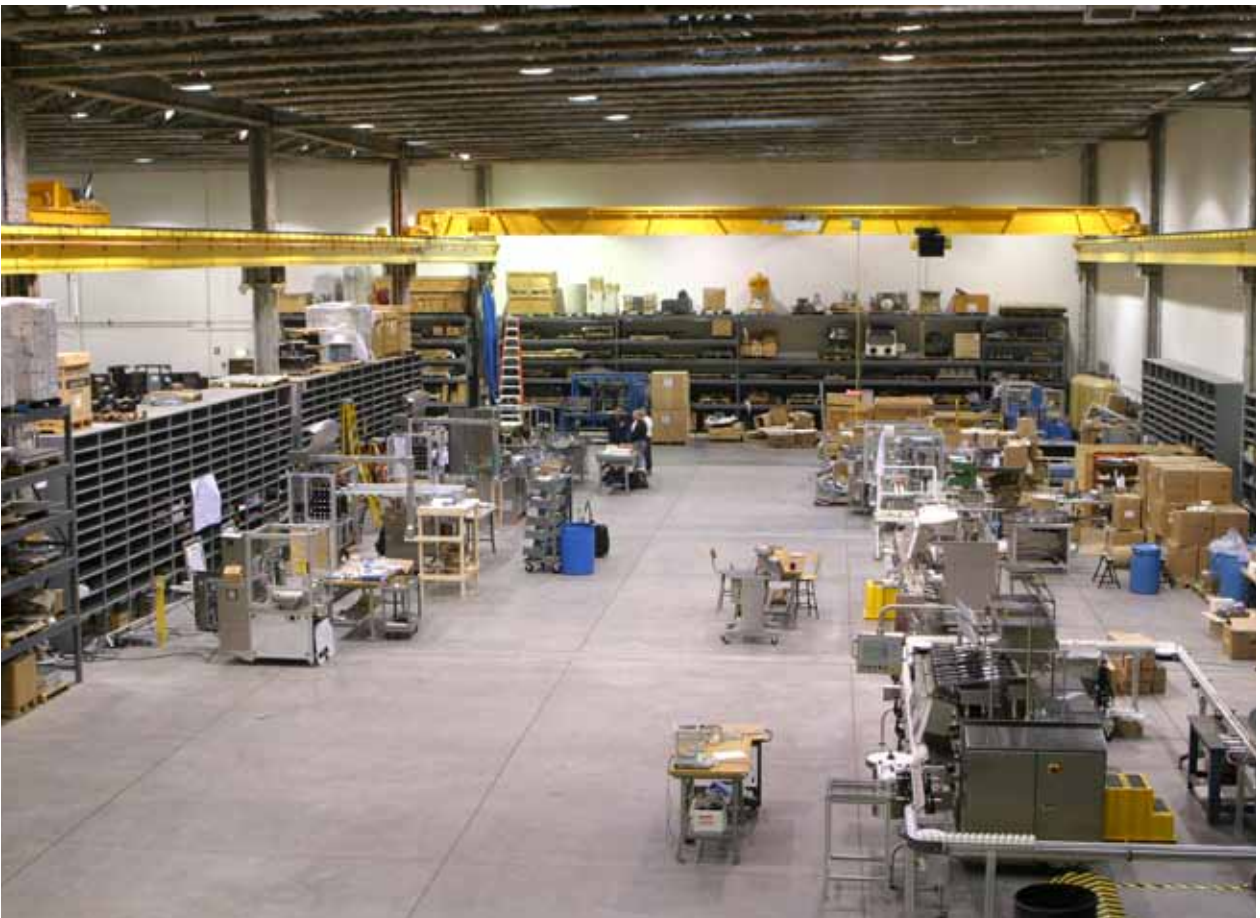
Photo of VISTA staging floor

neers from LIGHTHOUSE work as one team with automation engineers from DMW Automation. The LIGHTHOUSE automated VISTA Headspace Inspection Machines are designed and supported by a team having more than thirty years of experience in industrial implementations for the global pharmaceutical industry.